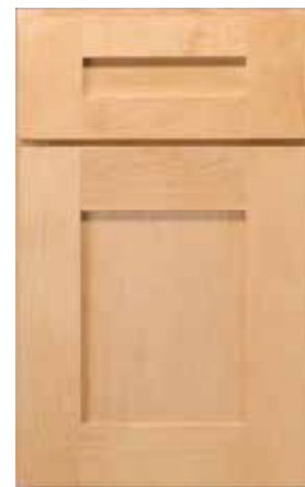
Wide Style Full Overlay