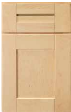
Wide Style Full Overlay