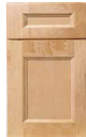
Wide Style Full Overlay